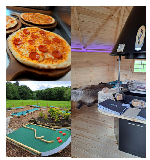
If you haven't already, please remember to collect, complete and sign your Seasonal Agreements before the end of March

• The Seasonal Loyalty card has been re-launched with new local gems on the list! Take a look at the list of places offering discounts exclusively for Seasonal Pitch Holders on our website (use the QR code on your card). It is worth checking it from time to time for any updates. Don't forget, you also receive 25% off Adventure Golf, BBQ Hut hire, Crazi Bugz, Fishing, Bathroom hire and most events on the park. Make sure you pick your loyalty card up when collecting your Agreement.